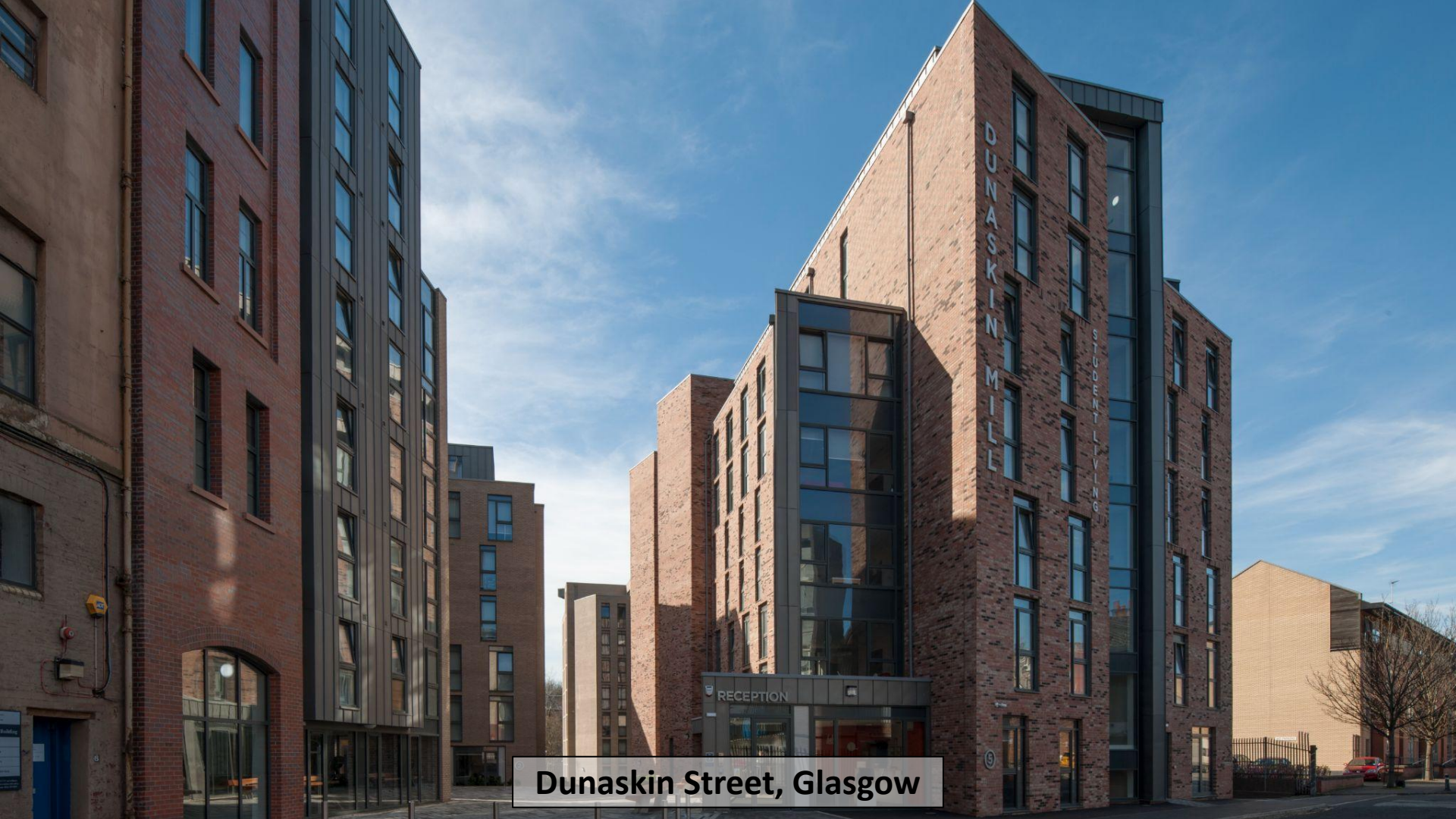
Dunaskin Street, Glasgow