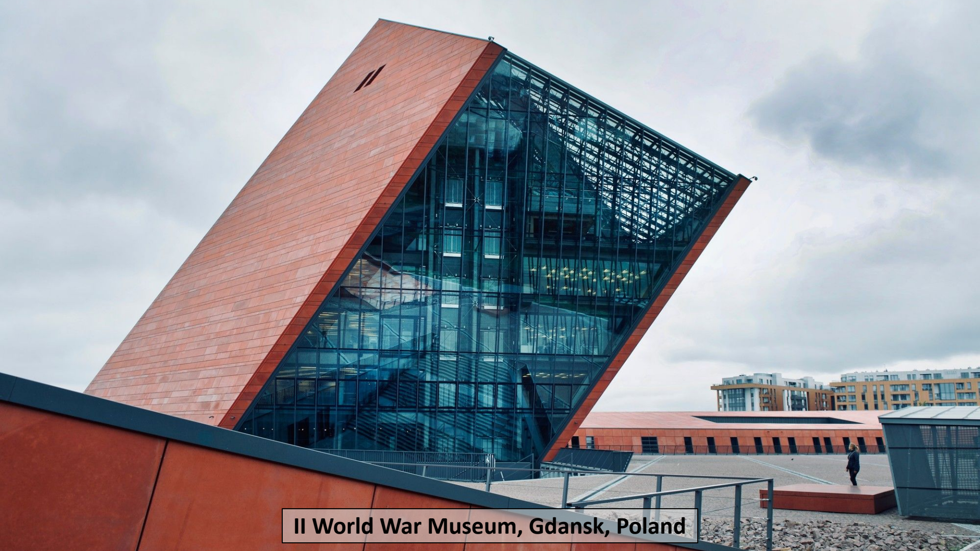
II World War Museum, Gdansk, Poland