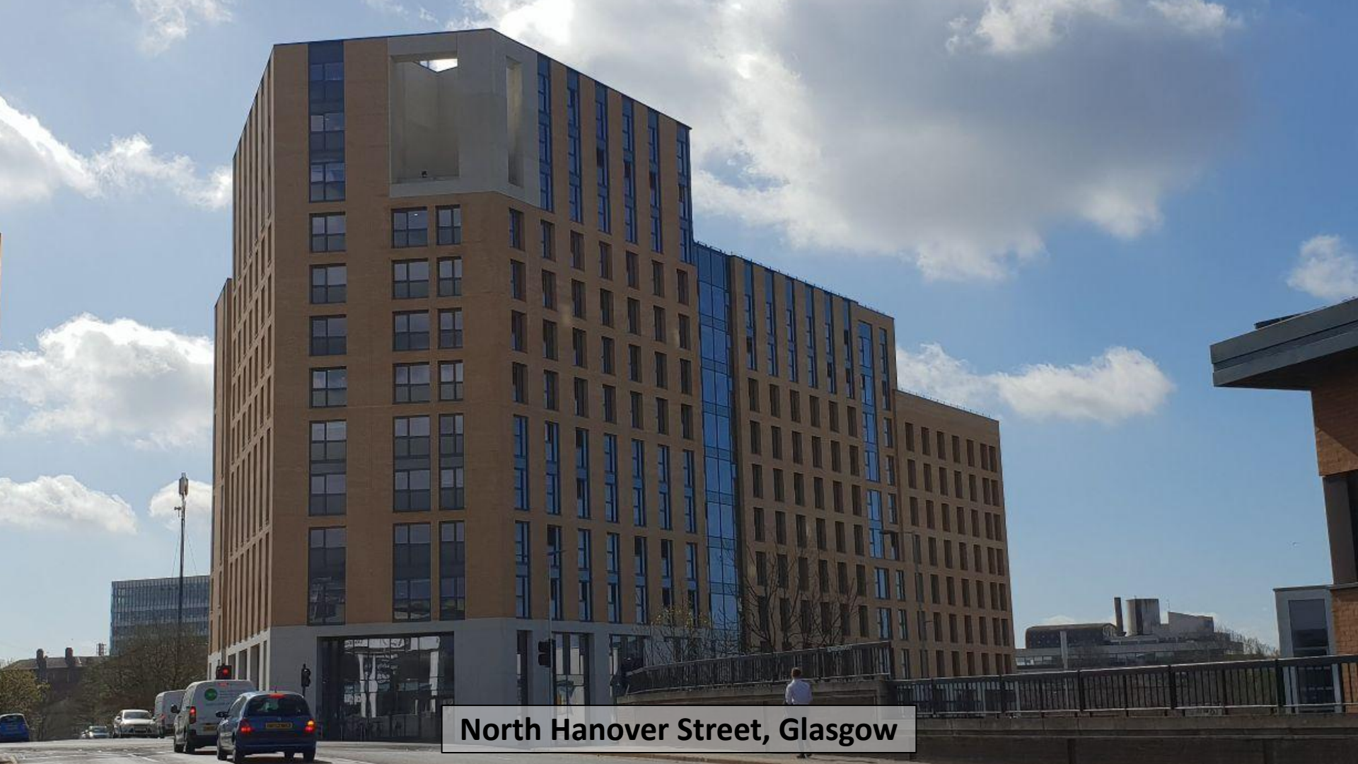
North Hanover Street, Glasgow