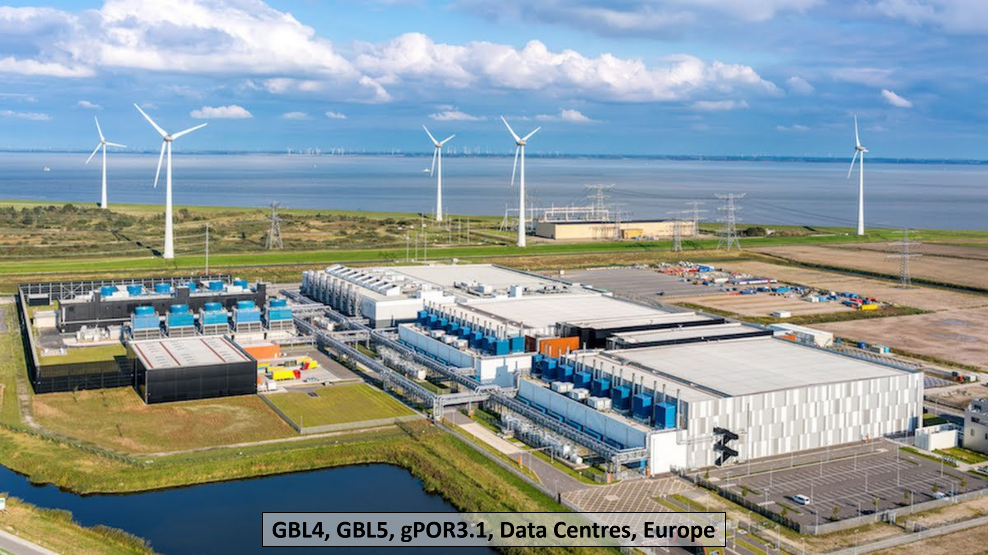
GBL4, GBL5, gPOR3.1, Data Centres, Europe