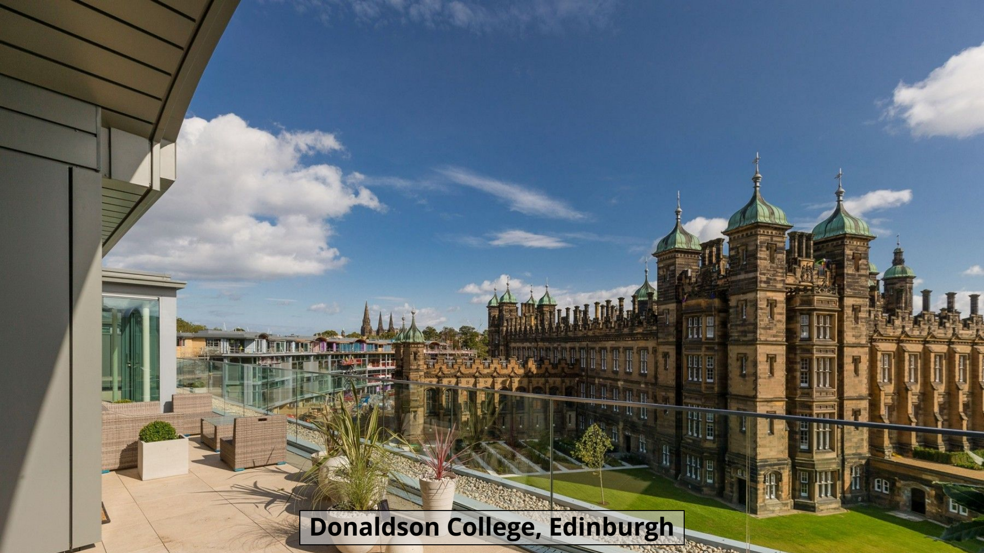
Donaldson College, Edinburgh