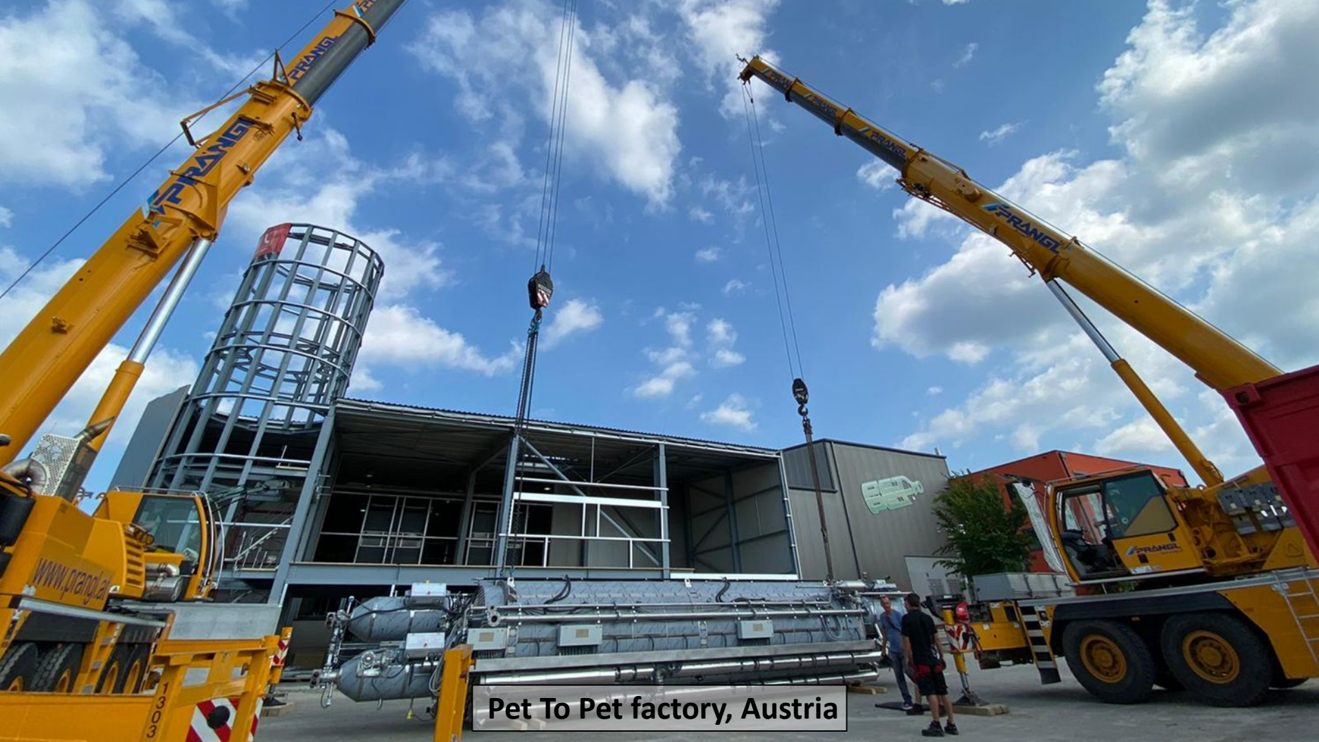
Pet To Pet factory, Austria